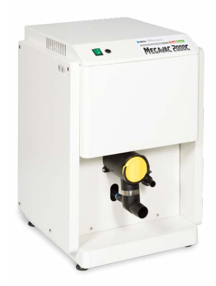
MEGAVAC 2000 Case

And the noise level is quite low in comparison to other products, approximately 55db.